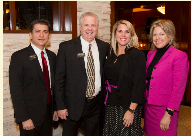
Village Builders & Newmark Homes