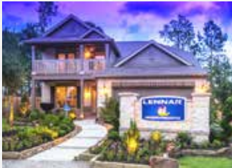
Lennar Homes From the $260s 2,300 – 3,550 Sq. Ft. (936) 423-5485