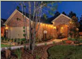
The Coalmont From the $250s 1,687 Sq. Ft.