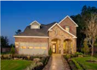
Chesmar Homes From the $260s 1,900 – 2,700 Sq. Ft. (832) 492-2267