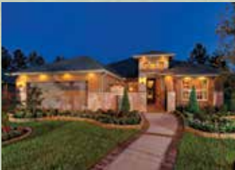
The Aurora From the $380s 2,536 Sq. Ft.

55+ Active Lifestyle (281) 670-1007 TAYLOR MORRISON