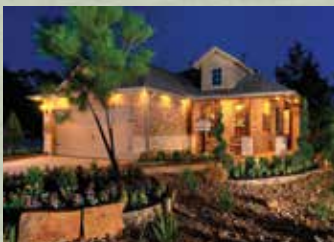
The Sedgewick From the $260s 1,840 Sq. Ft.