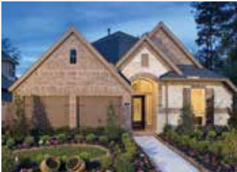
Perry Homes From the $290s 2,100 – 3,000 Sq. Ft. (936) 449-5010