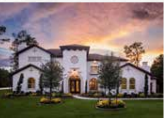
Partners in Building From the $650s 3,900 + Sq. Ft. (936) 447-1100