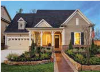
Darling Homes - American Classic From the $300s 2,100 – 3,300 Sq. Ft. (936) 447-2459