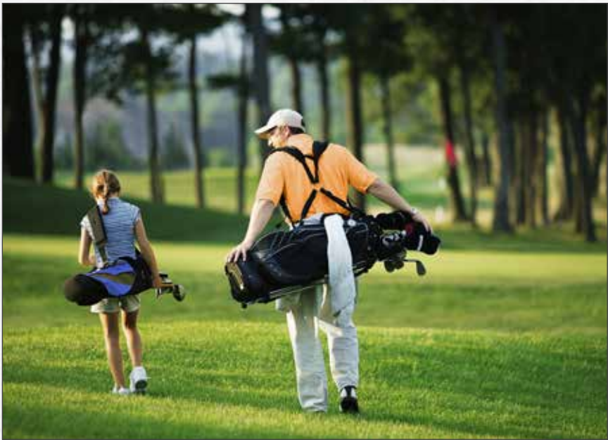
Dads, daughters and sons enjoy Woodforest Golf Club

The quickly expanding Woodforest Junior Academy introduces golf to youth nearly all year long, with spring sessions starting in late March for players age 6 to 14. The Spring Series for ages 6 to 10 will meet 4:30 to 6 p.m. Tuesdays March 21 through April 25. Cost is $200. Players age 11 to 14 can join the Elite Springs Series, which will meet 4:30 to 6 p.m. Wednesdays