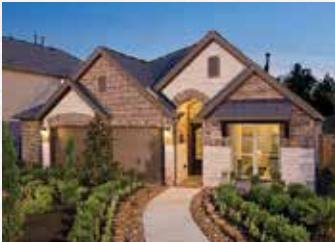
Perry Homes From the $240s 1,600 – 2,500 Sq. Ft. (936) 447-2200