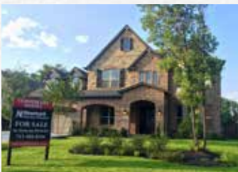
Newmark Homes From the $450s 3,700 - 5,000 Sq. Ft (936) 447-2211