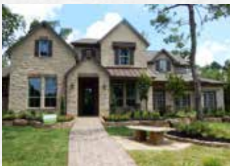
Coventry Homes From the $500s 3,600 – 4,800 (936) 447-1055