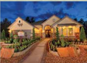
The Granada From the $360s 2,374 Sq. Ft.