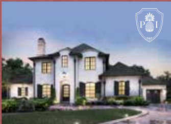
Jeff Paul Custom Homes $1,849,900 (281) 863-9199