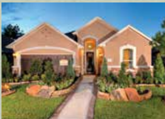
The Strasburg From the $300s 1,933 Sq. Ft.