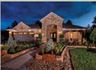
The Monarch From the $380s 2,878 Sq. Ft.