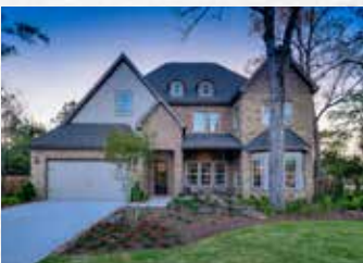
Gracepoint Homes From the $470s 4,000 + Sq. Ft. (936) 447-1006