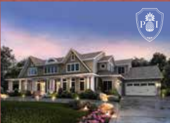
Tipler Design & Build $2,100,000 (281) 863-9199