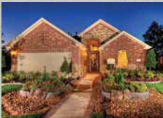
The Bellvue From the $300s 2,234 Sq. Ft.