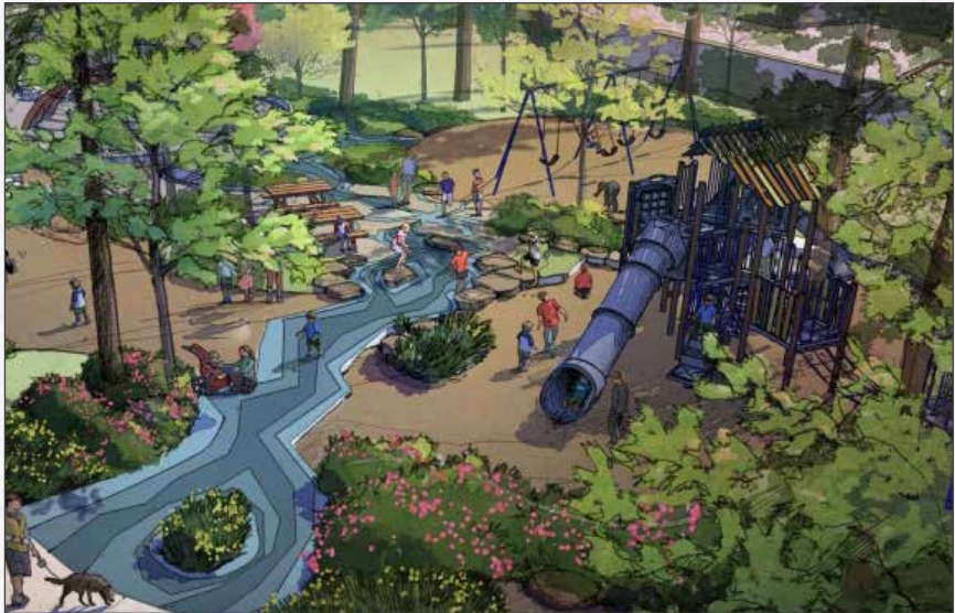
The new expansion coming to Kinderwood Park

Moms and Dads will appreciate the whimsical design modeled after the cute wildlife often spied in the neighborhood. Existing Kinderwood Park is expanding with the addition of new play structures and a swing set, while the 33-acre Christine Allen Nature Park will soon boast a new trail encircling a fountained pond.