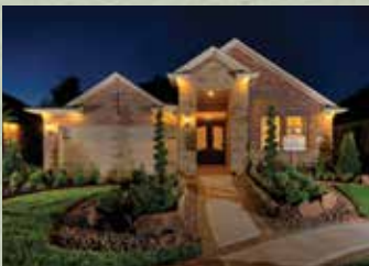
The Norwood From the $300s 1,977 Sq. Ft.