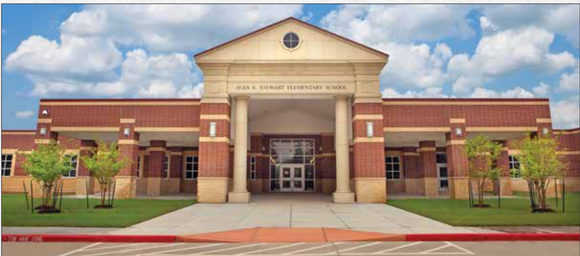
Woodlands. Classes were encouraged to donate pennies, nickels, dimes, quarters and bills in early February, with the class collecting the most

The Stewart Elementary Student Council also hosted a Father Daughter Dance, with music, dancing, dinner, Wonderland Bingo and more.