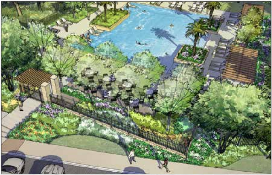
Fitness pool with 5 laps lanes coming to Woodforest this summer

After the workout, residents can relax on the sun deck. The fitness pool compliments the freeform resort pool already open at Forest Island, where daring swimmers can race down water slides and younger ones can splash in the beach-entry lagoon.