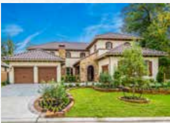
Darling Homes - Luxury Series From the $430s 3,200 – 4,100 Sq. Ft (936) 447-4093