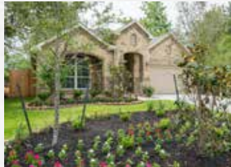
Lennar Homes – Next Gen From the $330s 2,800 – 2,900 Sq. Ft. (936) 423-5485