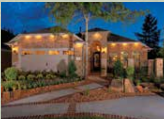
The Avondale From the $300s 2,062 Sq. Ft.