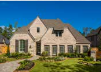
Highland Homes From the $270s 2,400 – 3,800 Sq. Ft. (936) 597-5952