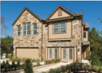
Chesmar Townhomes From the $190s 1,800 – 1,900 Sq. Ft. (936) 954-4948