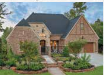
Darling Homes - Luxury Patio From the $420s 2,700 – 3,800 (936) 321-0437