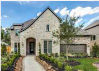
Westin Homes From the $370s 3,000 – 3,800 Sq. Ft. (832) 562- 3940