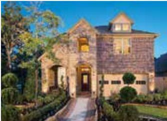
Chesmar Homes From the $220s 1,500 – 2,500 Sq. Ft. (832) 712-1486