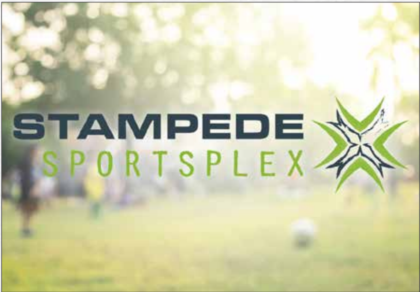
Stampede Sportsplex planned opening this spring

The first phase of the new Stampede Sportsplex — opening this spring — will bring three soccer fields to Woodforest’s roster of amenities. Two fields will be regulation-size with a third sized for junior play, which will allow youth leagues serving a wide age range to use the fields. Lights will allow for practices and games after the sun sets. Located around the bend