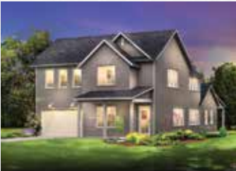
Empire Communities From the $300s Coming Soon!