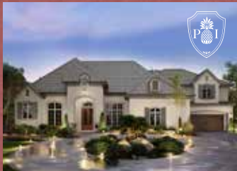
Sterling Classic Homes $2,149,000 (281) 863-9199